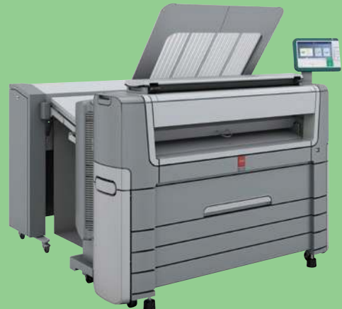
MULTIFUNCTION SYSTEM WITH OPTIONAL OCÉ 2400 FANFOLD