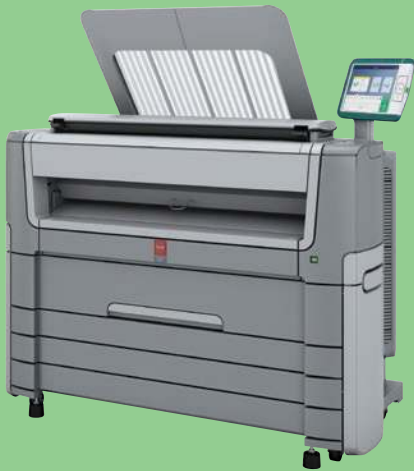
WITH OPTIONAL SCANNER EXPRESS II (MULTIFUNCTION SYSTEM)

Being able to submit files to your large format printer from anywhere can give you a big advantage when time is tight and deadlines are looming. The Océ ClearConnect software suite gives you more flexible ways to submit files to the printer. Print from your desktop via Océ Publisher Select™ software to manage complex document sets. With Océ Publisher Mobile, print from your smartphone or tablet when you are rushing to a meeting. Knowing you can print when you need to, can take some of the stress out of your work day.