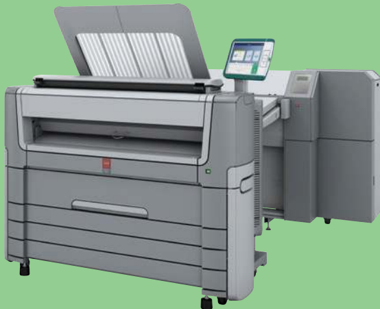
MULTIFUNCTION SYSTEM WITH OPTIONAL OCÉ 4312 FULLFOLD