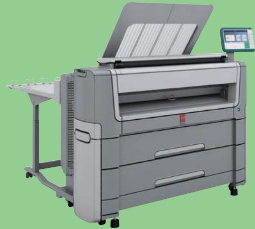
MULTIFUNCTION SYSTEM WITH OPTIONAL OCÉ DELIVERY TRAY AND OPTIONAL MEDIA DRAWER